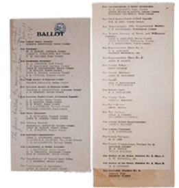
Texas ballot, 1918.