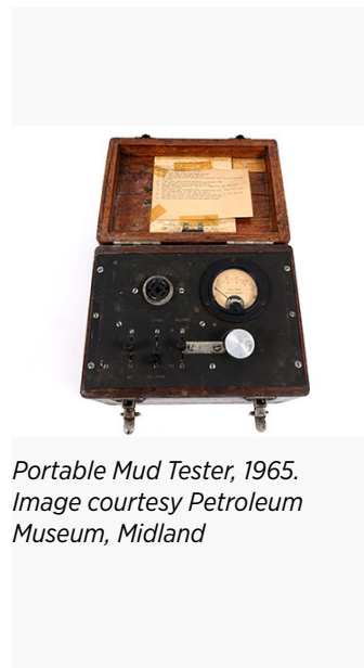
Portable Mud Tester, 1965.