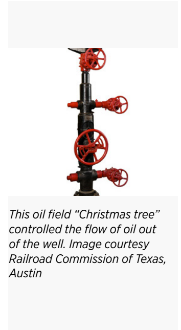
This oil field "Christmas tree" controlled the flow of oil out of the well.