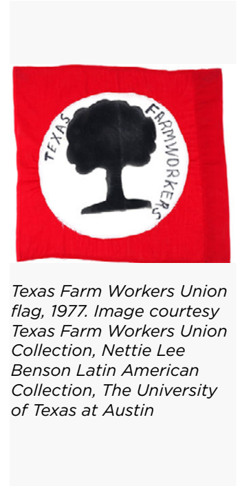
Texas Farm Workers Union flag, 1977.