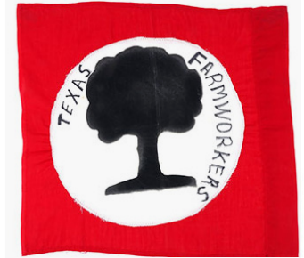
Texas Farm Workers Union flag, 1977.