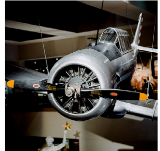
Discover the AT-6A "Texan" Airplane in the Artifact Gallery