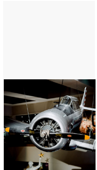
Discover the AT-6A "Texan" Airplane in the Artifact Gallery

New Top Ten lists will be added over time to round out the full scope of the Texas History curriculum, so keep returning to the website for updates. Looking for more resources on these topics beyond the Top Ten, or curious how other teachers have used what is found on these lists? Email Education@TheStoryofTexas.com .