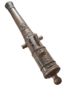
Bronze four-pound cannon found on the ship La Belle