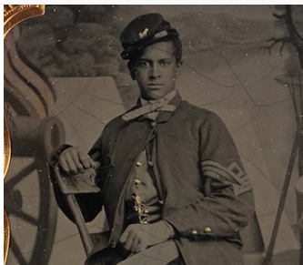
Sixth Plate Tintype Portrait of an Unidentified African American First Sergeant, United States Colored Troops - detail.