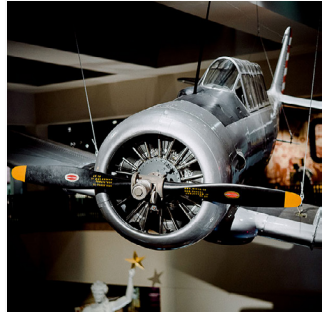
Discover the AT-6A "Texan" Airplane in the Artifact Gallery