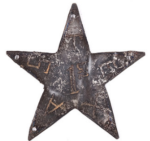
Silver Star of a member of the 1st Texas Infantry, Hood's Brigade.