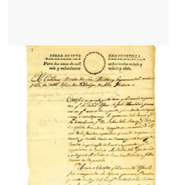
Cover page, Empresario Martín de León's report to José Antonio Saucedo, 1826.