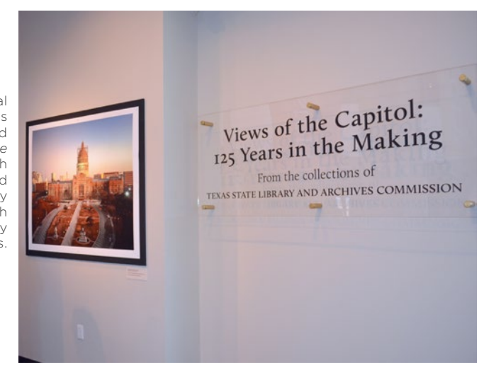
Special exhibitions included Views of the Capitol which combined 19th century drawings with 20th century photographs.

The Battleship TEXAS exhibition celebrated the 100th birthday of the legendary USS Texas, considered the most powerful naval weapon of its time.