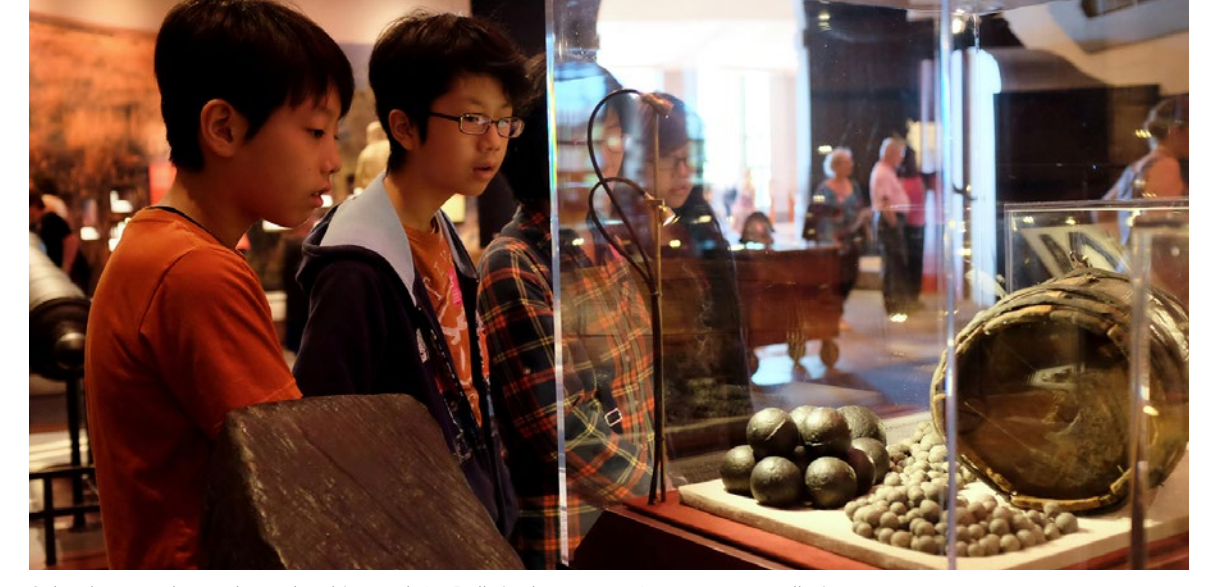
School groups learn about the shipwreck La Belle in the museum's permanent galleries.

The Museum welcomed over 101,400 students, teachers and chaperones through on-site field trips, professional development workshops, and distance learning programs — an all-time high since the Museum opened in 2001. Students represented 92 counties from all corners of Texas and beyond. New curriculum guides and partnerships with Texas school districts, Education in Action, and the Texas State Historical Association increased the Museum's impact.