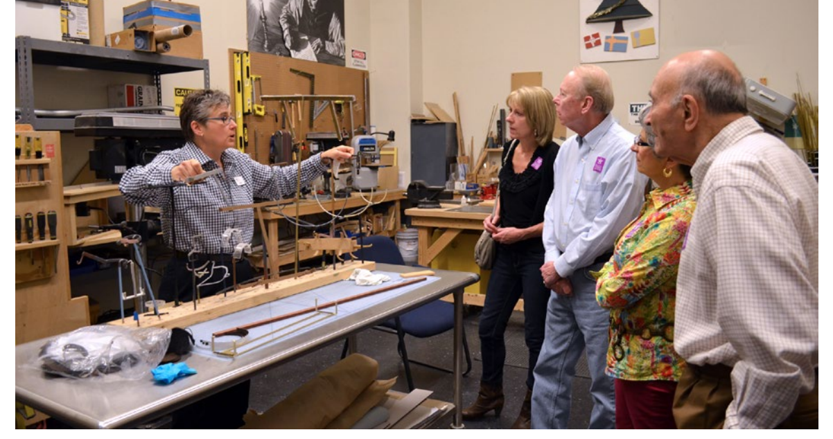
Museum members enjoy a behind-the-scenes tour, providing insight into the creating of artifact mounts used throughout the museum.