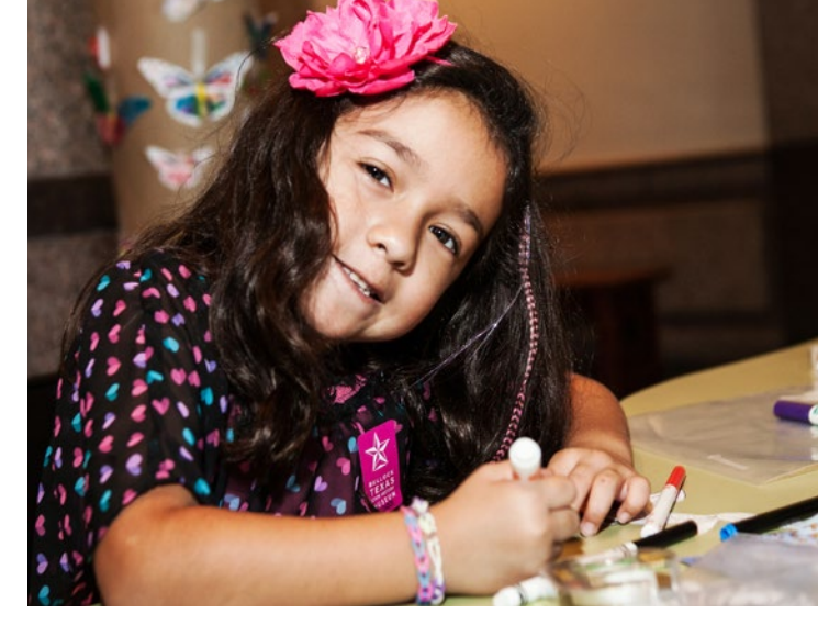
Young artist at work during a Create Your Own program.

Children fly butterflies on the plaza during a Free First Sunday program.