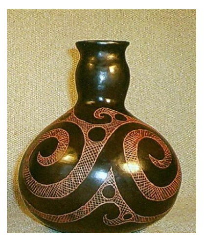
Intertwining Scrolls by Jeri Redcorn