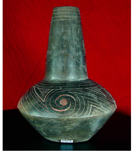
Holly Fine Engraved Bottle, Ancient Caddo Pottery

Over time the Caddo shifted their focus and began to use metal and other materials for their pots. Archeologists found that the last traditional clay pots were made in the 1850s. However, there is a movement today by Caddo artists to revive the art of clay pot making. They are making pots using the same methods, tools and designs as their ancestors. They are also working hard to teach this craft to younger generations so that the tradition may live on.