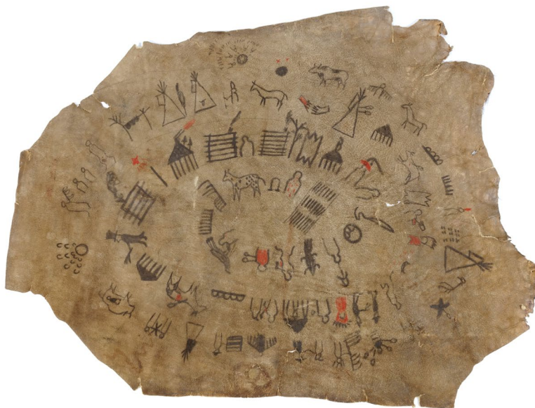
Lakota winter Count, 1800s