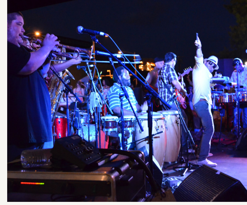
Grupo Fantasma performs during Music Under The Star

history. Two Family Days for this film and Rocky Mountain Express offered more hands-on activities for families and garnered remarkable attendance numbers.