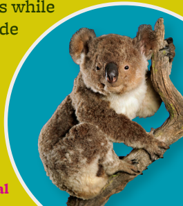
Koala, a marsupial

The ancestor of all mammals almost certainly laid eggs, as do most vertebrates and a tiny minority of living mammals, the monotremes — like the platypus and echidnas of Australia and New Guinea. But the vast majority of modern mammals are placentals . They've evolved to give live birth to babies that are nourished for a long time inside the mother's body, using an organ called a placenta. A few hundred other living species (and many more fossil forms), like koalas and kangaroos, are marsupials ; their young are born very immature and much of their development occurs while drinking milk, typically inside a pouch on their mother's belly. The group Mammalia is named for mammary glands, which produce milk — as all mammal species do.