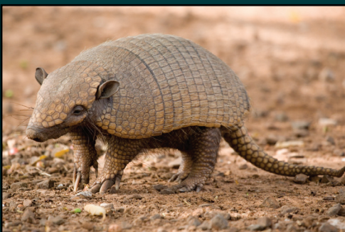
The six-banded armadillo is almost completely covered by bony, keratin-capped armor plates.

As species evolve over time, "extreme" traits can arise: characteristics that differ widely from those found in ancestors or from the most common condition. Examples include the tiny brain of the extinct, two-ton Uintatherium ; the bipedal hopping of kangaroos; or the venom of species of Solenodon , large shrew-like mammals. Humans also have a mix of both normal traits inherited from early ancestors (we're warm blooded and have differentiated teeth and five fingers and toes) and specialized extreme features (upright bipedalism , and big brains relative to our body size).