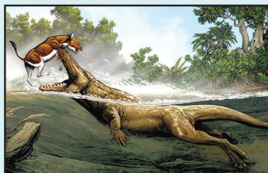
Ambulocetus , an amphibious early whale with legs, probably hunted small mammals much as today's crocodiles do.

Explain that like most other mammals, all whales are descended from an ancestor with four limbs and feet. Ask students whether Ambulocetus lived in water or on land, and to support their answers.