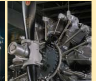
TEXAS AND THE NATION AT-6 "Texan" Made in Dallas, the AT-6 (ca. 1941-1942) served as a trainer aircraft for more than 100,000 World War II pilots.