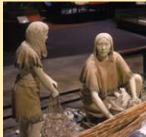
FIRST ENCOUNTERS Karankawa Canoe The Karankawa people inhabited the region along the Texas Gulf coast during the period of Spanish exploration.