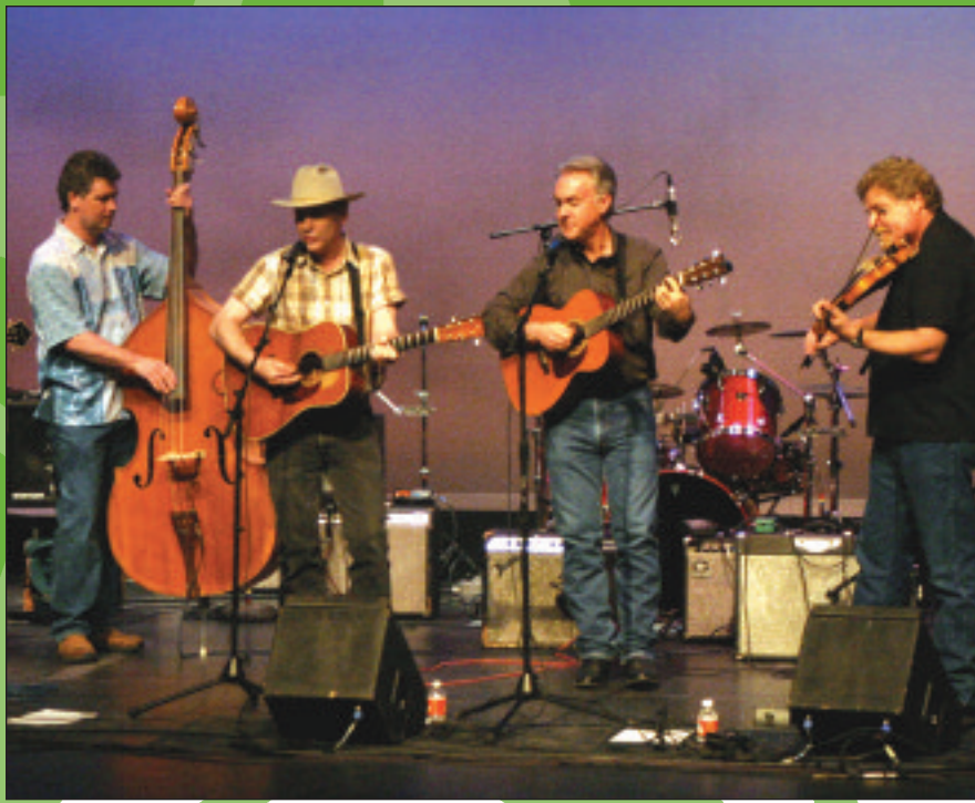
The Spirit of Texas Music Series featured performers such the Texas Swing Kings and offered audiences a unique opportunity to hear artists' stories as well as their music.