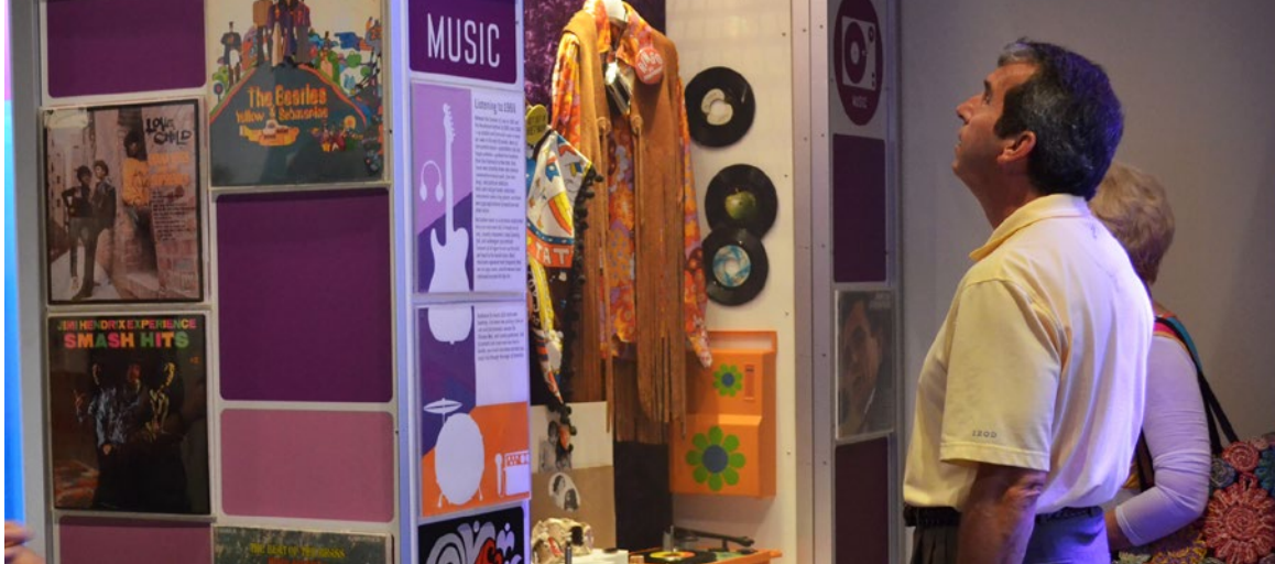
The 1968 Exhibit included the launch of television's Laugh-In and the assassinations of Reverend Martin Luther King, Jr. and later Robert Kennedy.

and a Huey helicopter, assembled and dismantled by local Vietnam veterans.