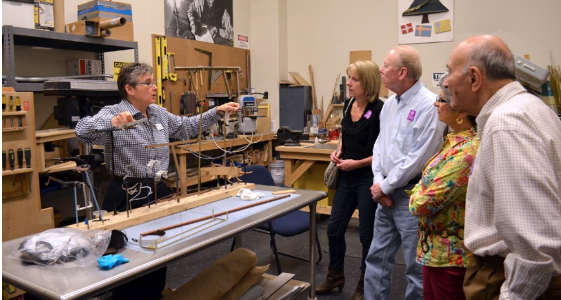
Museum members enjoy a behind-the-scenes tour, providing insight into the creating of artifact mounts used throughout the museum.