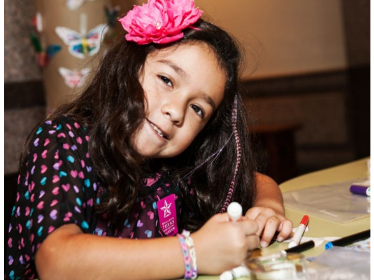
Young artist at work during a Create Your Own program.

Children fly butterflies on the plaza during a Free First Sunday program.