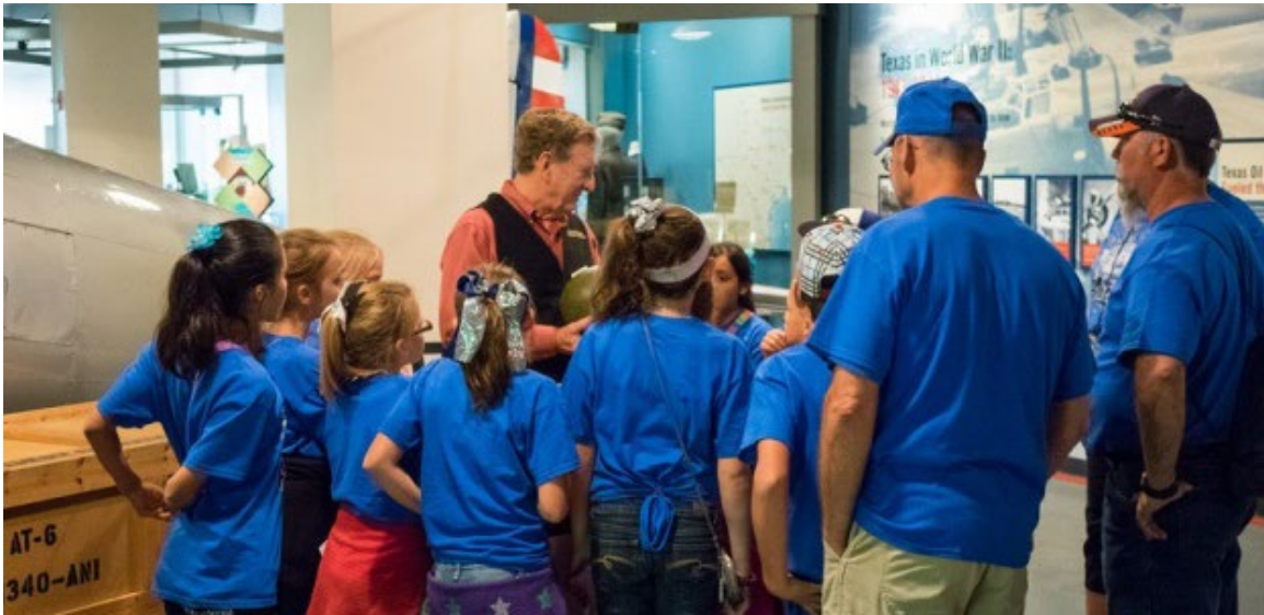
School groups learn about military history in the museum’s permanent galleries.