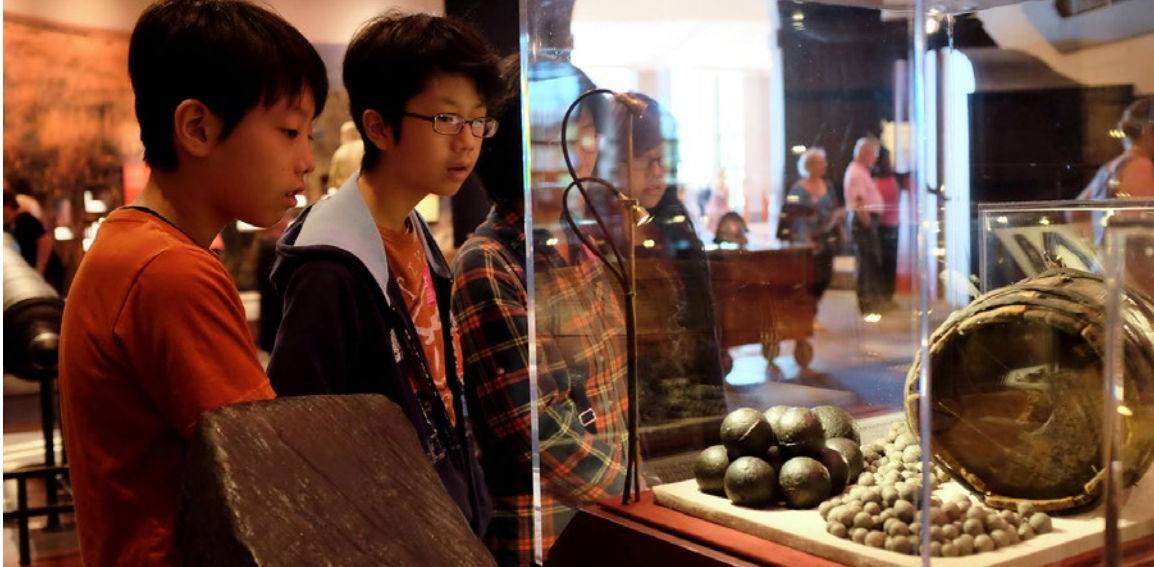
School groups learn about the shipwreck La Belle in the museum's permanent galleries.

The Museum welcomed over 101,400 students, teachers and chaperones through on-site field trips, professional development workshops, and distance learning programs — an all-time high since the Museum opened in 2001. Students represented 92 counties from all corners of Texas and beyond. New curriculum guides and partnerships with Texas school districts, Education in Action, and the Texas State Historical Association increased the Museum's impact.